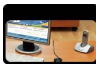
Local/LD and Internet