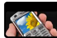
Wireless/ Air Card